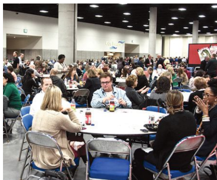
Lunchtime on the Expo Floor.