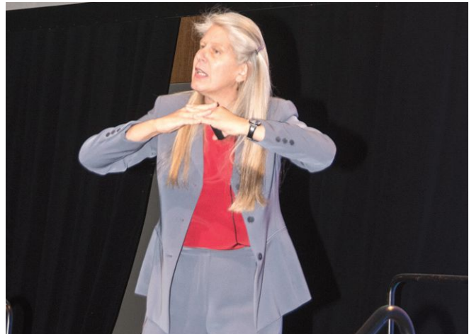
“We are all about loops and circuitry. It’s why we can think of a thought that angered us, and 20 years later, it still will.” — Jill Bolte Taylor, neuroanatomist and author of “My Stroke of Insight”