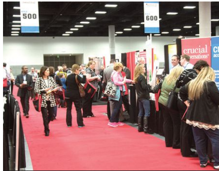
Attendees troll the Expo's red carpet in search of information on the latest training products and services.