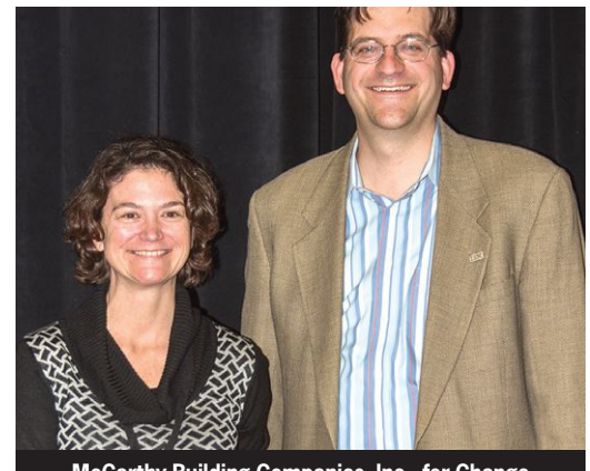
McCarthy Building Companies, Inc., for Change Management and Technology Training Initiative