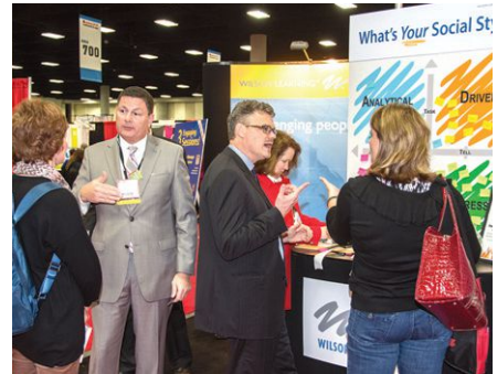
Attendees get the scoop on their social style.