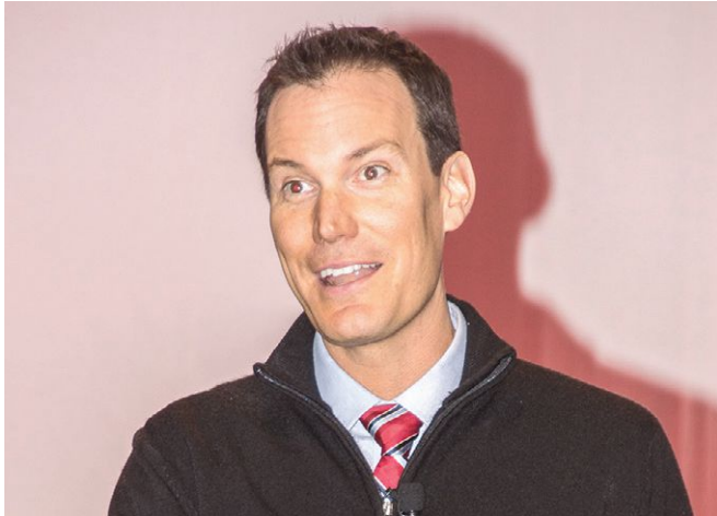
“If the brain can be imprinted with a negative pattern, it equally can be imprinted with a positive one.” — Shawn Achor, positive psychologist and author of “Before Happiness”