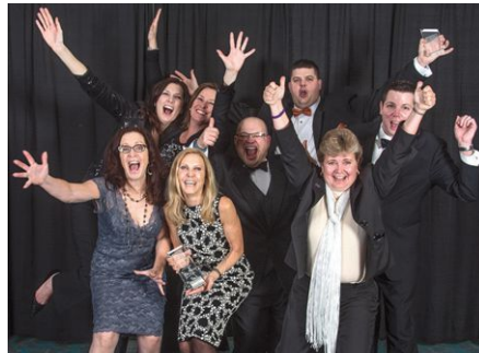
Keller Williams Realty, Inc., moves into the No. 2 position.