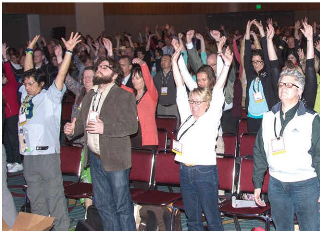
Attendees take a deep breath and exhale their stress during Jill Bolte Taylor’s keynote.