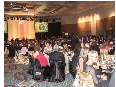
The 2014 Training Top 125 glitterati.