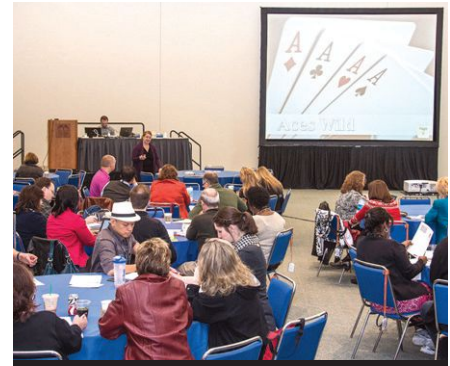
Everything's coming up aces for these session participants.