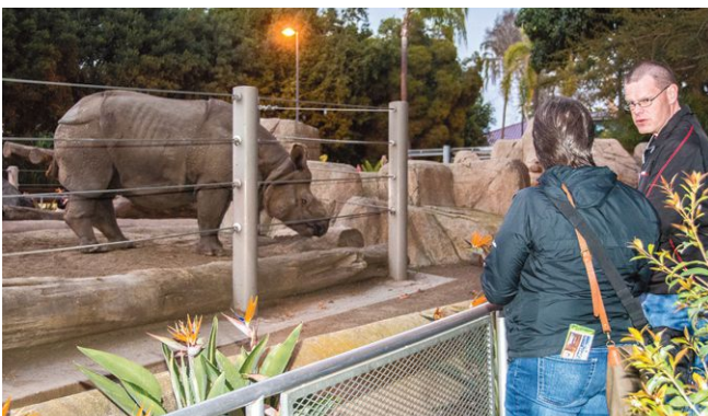
Who's watching who at the San Diego Zoo?