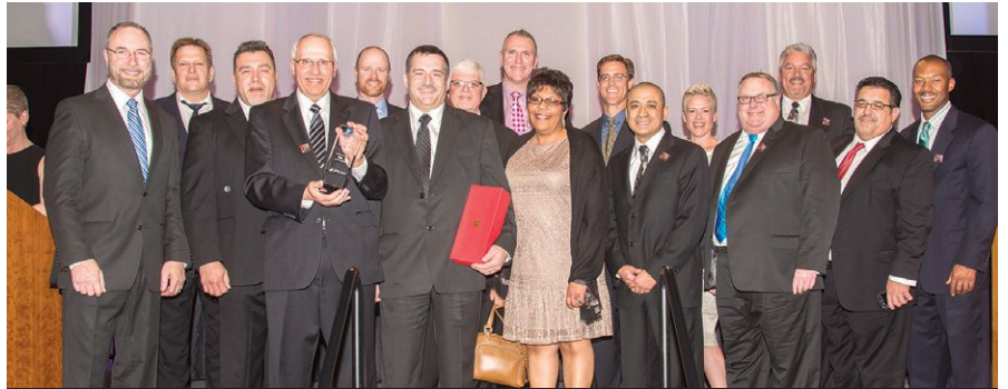
Jiffy Lube International, Inc., revs into the No. 1 spot.