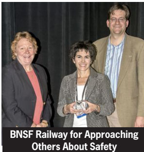
BNSF Railway for Approaching Others About Safety