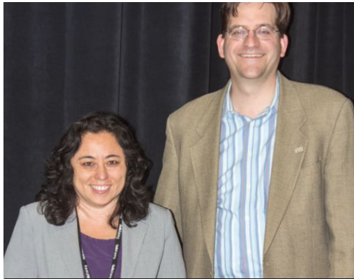
Automatic Data Processing for Accelerating First-Year Sales Performance

BNSF Railway Discover Financial Services First Data Corporation First Horizon National Corporation Walgreens