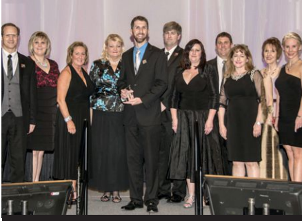
Mohawk Industries, Inc., takes the stage at No. 5.