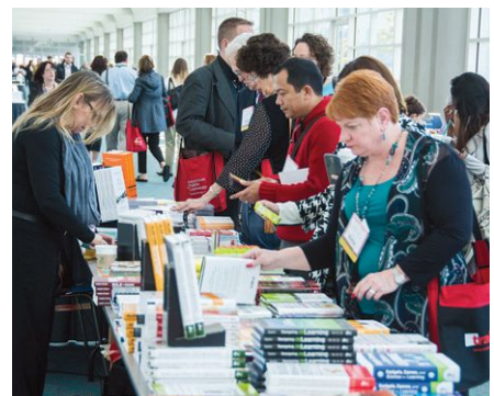
Perusing the latest training titles.