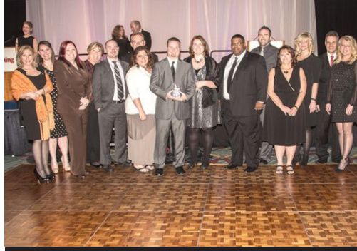
CHG Healthcare Services notches fourth place.