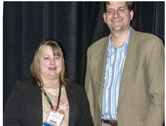
Baylor Health Care System for Lean and Process Improvement Training