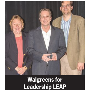
Walgreens for Leadership LEAP