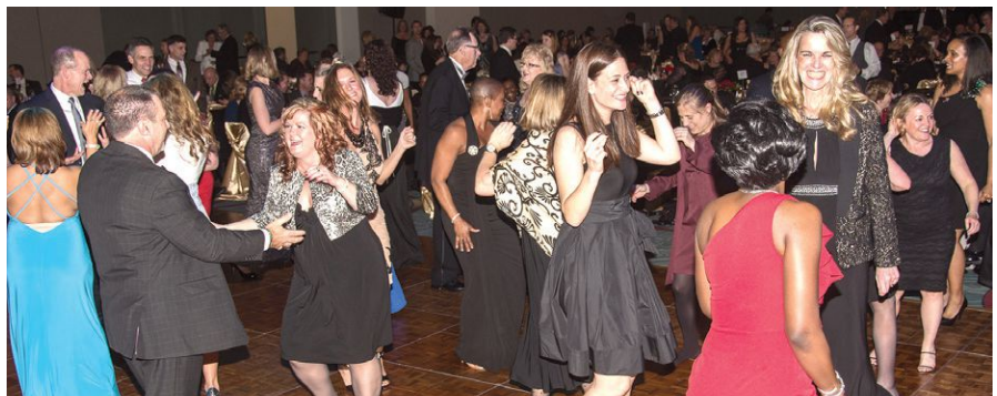
Top 125ers get in the groove on the dance floor.