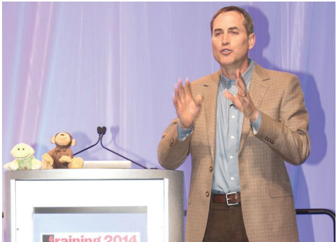
“Simplicity changes behavior. Focus on three things: 1. Get specific. 2. Make the behavior you want to change easy. 3. Trigger it (the call to action).” — BJ Fogg, experimental psychologist and director of Stanford’s Behavior Design Lab