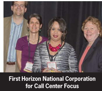
First Horizon National Corporation for Call Center Focus