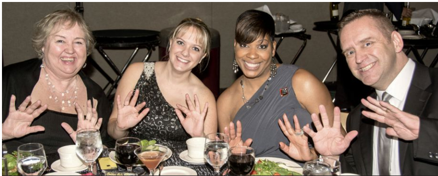
The Gala earns a 10 from these Top 125ers.