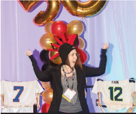
This touchdown dance gets the crowd going at the Super Bowl party.