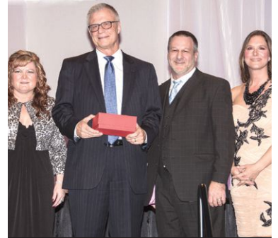
Capital BlueCross breaks into the Top 5 at No. 3.