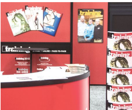
What's black and white and read all over? Training magazine, of course!