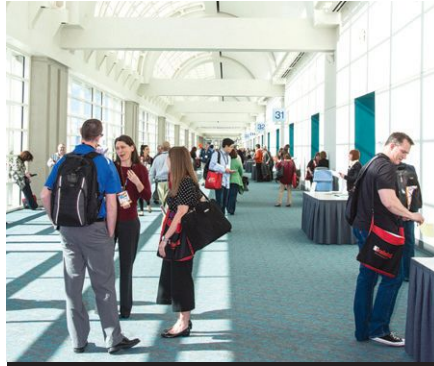
Attendees connect between conference sessions.