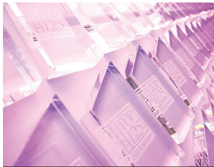
It's crystal clear what this night is all about.

Earlier in the day, Training Top 125 Best Practices and Outstanding Training Initiative award winners received crystal trophies during a ceremony on the Expo Stage (see previous page).