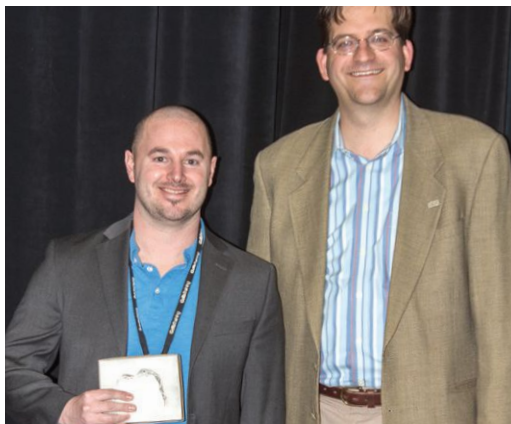
CHG Healthcare Services for Wellness Coaching