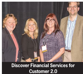
Discover Financial Services for Customer 2.0